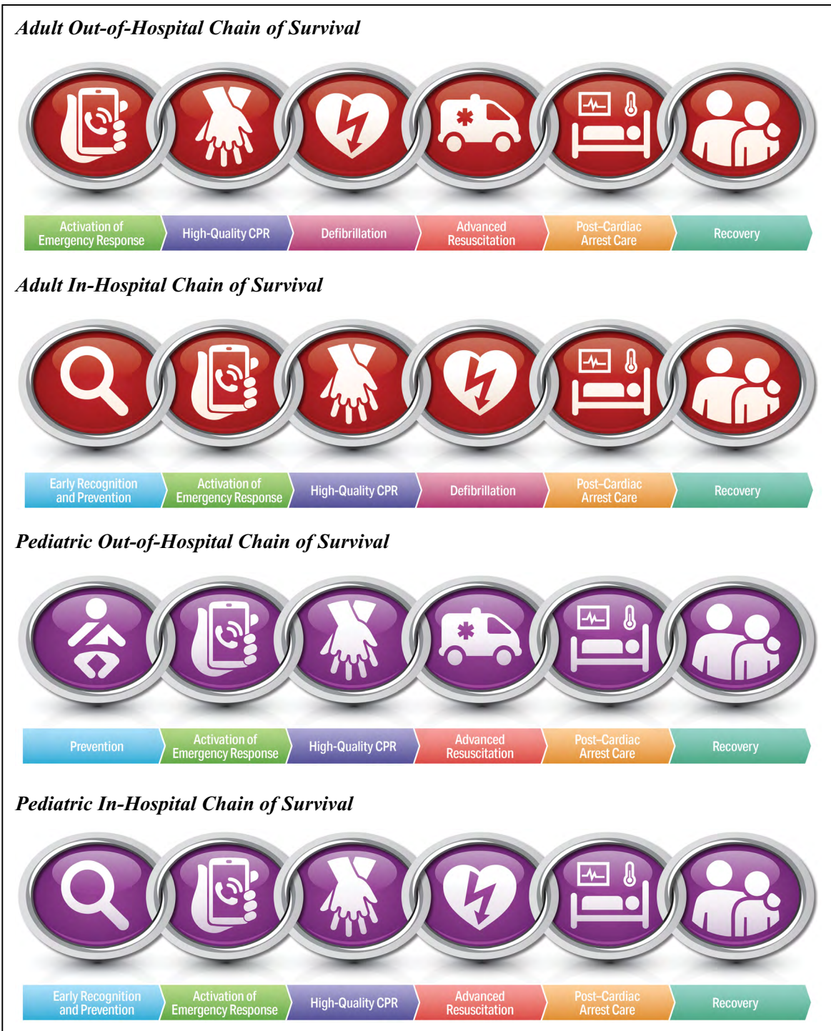
Figure 1. The American Heart Association Chains of Survival. CPR indicates cardiopulmonary resuscitation.

preparation in advance of birth as well as resuscitation and stabilization at the time of birth and through the first 28 days after birth. 15